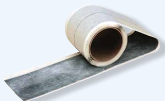
437299 Strip RL 80 S