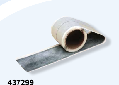
437299 Strip RL 80 S