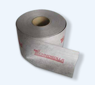
437337 Strip RL 120