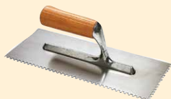
28x12 cm trowel stainless steel 8 mm square serrations