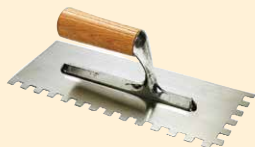
28x12 cm trowel stainless steel 10 mm square serrations

For applications in hot climates / environments and / or on absorbent substrates, thoroughly pre-dampen the surface immediately prior to the product application, but avoid any ponding / standing water on the surface, which must not be damp to touch and not with a dark-matt / wet surface appearance i.e. it must be saturated surface dry (SSD).